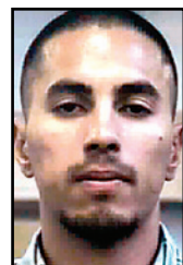
ASTORGA: Accused in the 2006 death of deputy